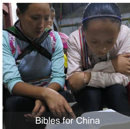
Bibles for China