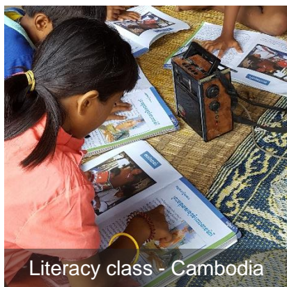
Literacy class - Cambodia

Albania, Algeria, Austria, Cambodia, Cameroon, Chile, China, Côte D'Ivoire, Cuba, Egypt, Guatemala, Gulf States, Honduras, India, Iraq, Israel, Lebanon, Lithuania, Malawi, Morocco, Nigeria, Pakistan, Paraguay, Peru, Philippines, Rwanda, Slovakia, South Sudan, Suriname, Swaziland, Togo, Uganda, Uzbekistan, Venezuela.